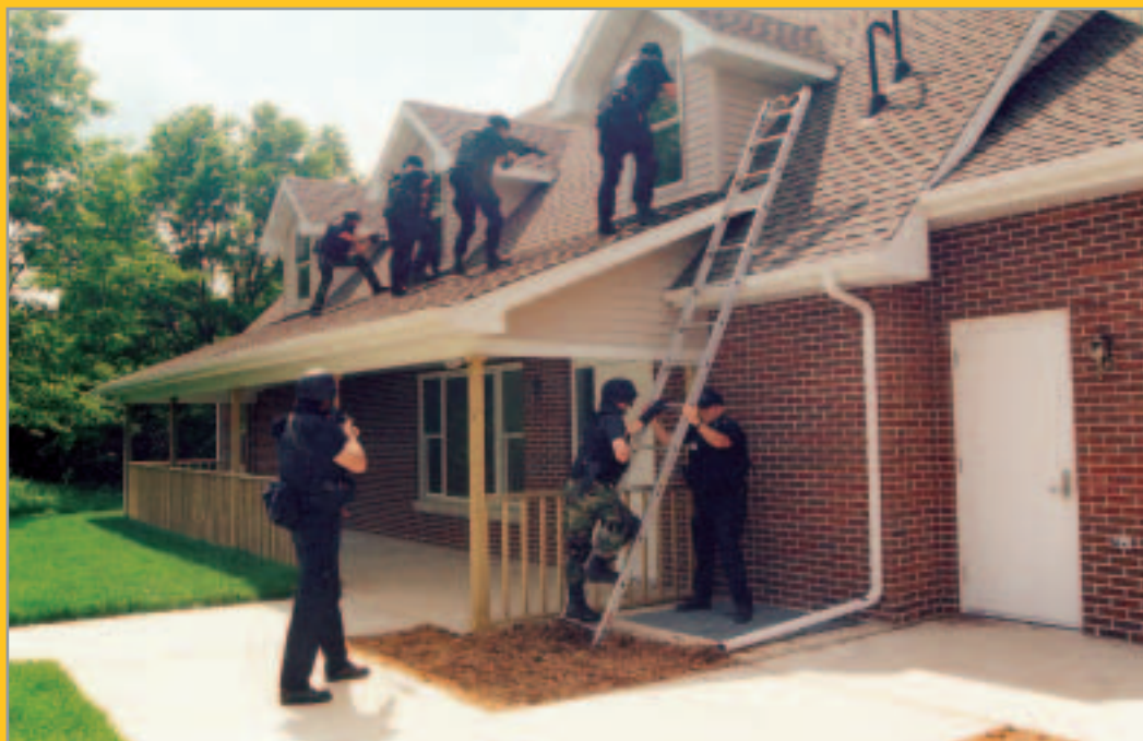
NWTTC's Tactical House is part of NWTTC's Public Safety and Criminal Justice Technology Center. The Tactical House at just over 6000 sq. feet features: