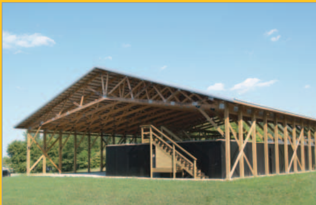
NWTTC's Forcible Entry Structure / Firearms Training Area is part of NWTTC's Public Safety and Criminal Justice Technology Center. The Forcible Entry Structure, manufactured by PortaTarget , is approximately 4500 sq. ft., covered for year round use, featuring: